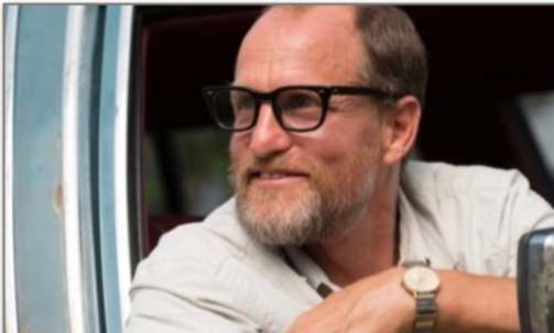
Woody Harrelson in Wilson (Fox Searchlight)

Fox Searchlight feature Wilson filmed for 30 days at more than 50 locations in the Twin Cities metro ( Minneapolis, St. Paul, Roseville, Spring Park, Oak Park Heights, Stillwater, Bloomington, Bayport, Maplewood and Woodbury ). The production employed more than 100 local crew members and 40 of the 54 speaking roles were played by Minnesota actors as were hundreds of background roles.