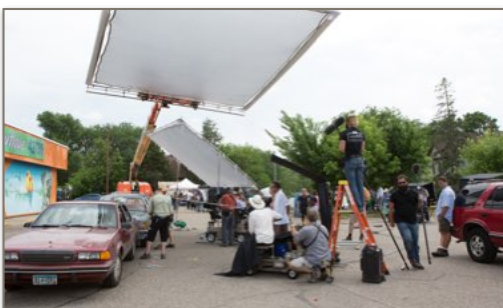
Minnesota crew on location for Wilson.

Wilson , starring Oscar nominees Woody Harrelson ( True Detective , The Hunger Games ), and Laura Dern ( Wild , Enlightened ), debuted to a sold out crowd at this year's Sundance Film Festival in Park City, Utah. Wilson will be released in theaters nationwide in March.