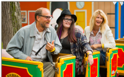
Woody Harrelson, Isabella Amara and Laura Dern on location at Como Town, St. Paul.